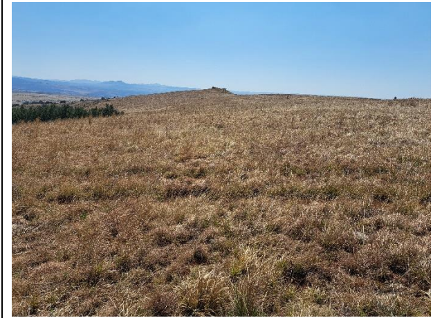
View of the BP1 footprint towards the north and north-east