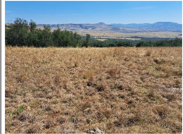
View of the BP1 footprint towards the south and south-west